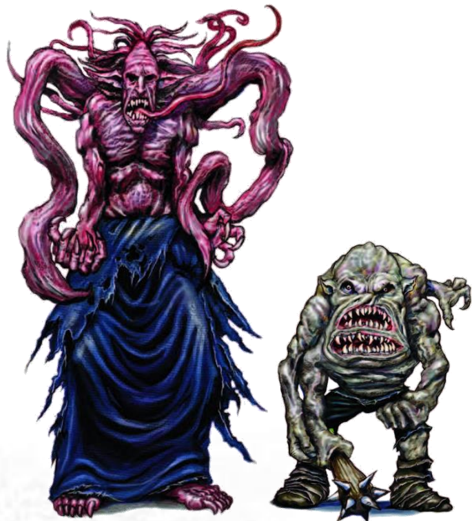
A dolgaunt (left) and a dolgrim (right)

The byeshk version of a melee weapon or ten pieces of ammunition costs 100 gp more than the normal versions and weigh twice as much.