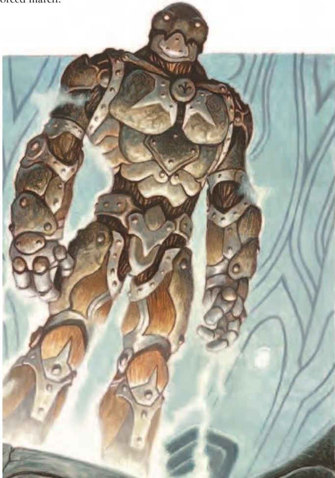
A warforged, fresh from a creation forge

Living Construct Nature. Warforged do not breathe or sleep, and they do not need to eat or drink, though they may do so if they wish (to benefit from potions or magical foods). They do not suffer exhaustion from a forced march.