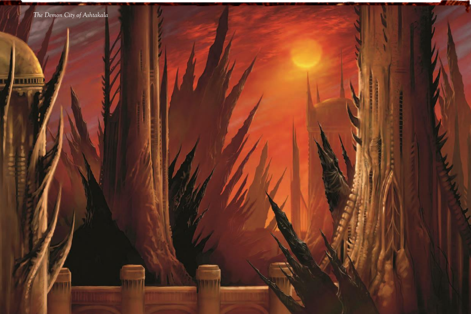
The Demon City of Ashtakala

The warrior-like zakya have served the rajahs and their prakhutu for age upon age, since the birth of Eberron. These fiends are incredibly skilled in martial combat, surviving myriad wars and conflicts. In the unlikely event that one is felled in battle, their essence will be reborn in Khyber's depths like all rakshasa. However, even if the departed zakya's personality and memories do not survive reincarnation, the newborn zakya will retain the skill and prowess learned through countless millennia of its past lives. This makes every zakya, no matter how recently formed, a terror to behold in personal combat.