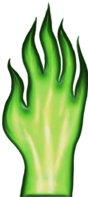
The heraldic device of the Order of the Emerald Claw

Marshals are highly skilled officers, often in command of one or two platoons of sergeants and soldiers, and may have a cadre of knights as their elite guards or executors.