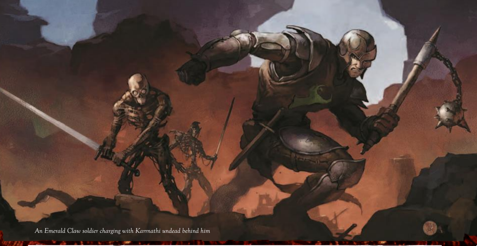
An Emerald Claw soldier charging with Karrathi undead behind him