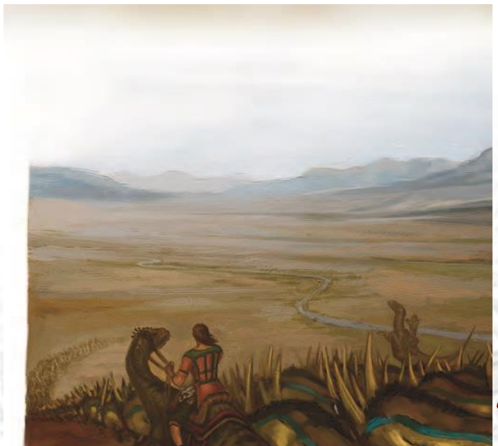
Talenta halflings mounted on fastieths, herding tribex

Bite. Melee Weapon Attack: +1 to hit, reach 5 ft., one target. Hit: 4 (1d6 - 1) piercing damage.