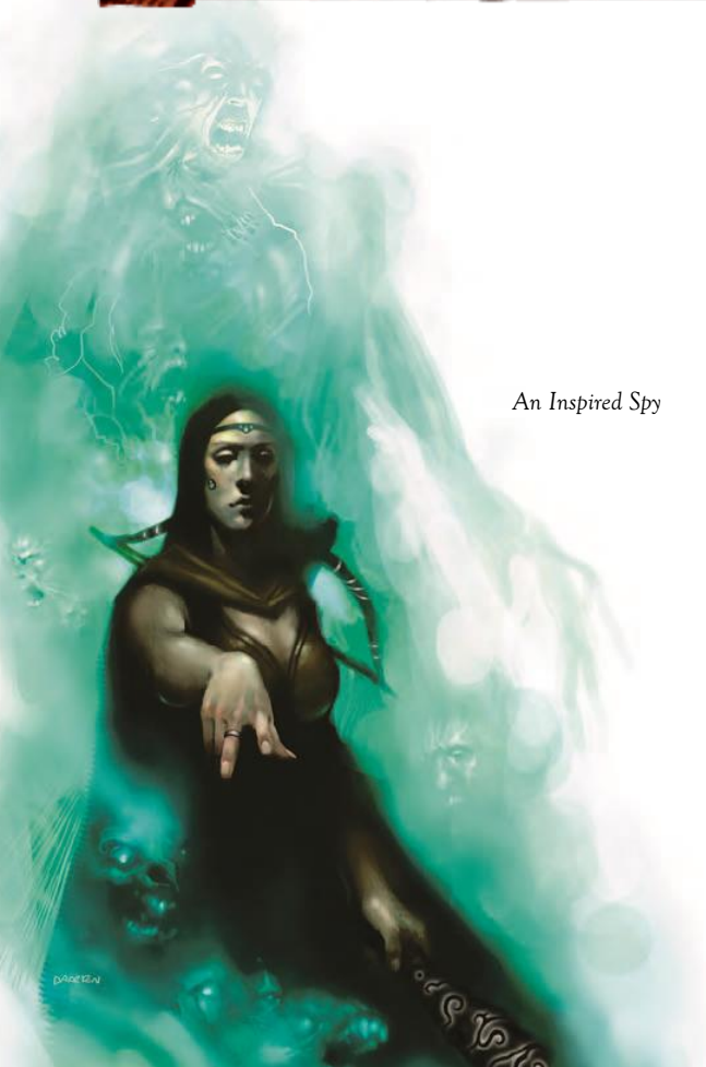
An Inspired Spy

Hand Crossbow. Ranged Weapon Attack: +5 to hit, range 30/120 ft., one target. Hit: 5 (1d6 + 2) piercing damage.