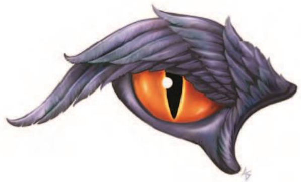
The symbol of il-Lashtavar and the Dreaming Dark

Usvapna quori serve the hashalaqs as their spies and assassins. Also known as "dream masters", the usvapna revel in twisting the dreams of mortals against themselves, turning hope to despair and triumph into anguish. They can hear the secret doubts of mortals, the voices in their minds that foment hesitation and insecurity. Usvapna quori hear this voice in their own minds, but unlike mortals their inner voices are in complete accord with themselves, allowing the dream masters to split their mental attention in two with ease.