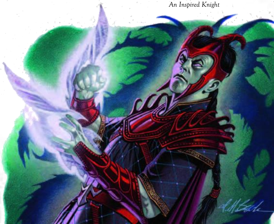
An Inspired Knight

Parry. The knight adds 2 to its AC against one melee attack that would hit it. To do so, the knight must see the attacker and be wielding a melee weapon.