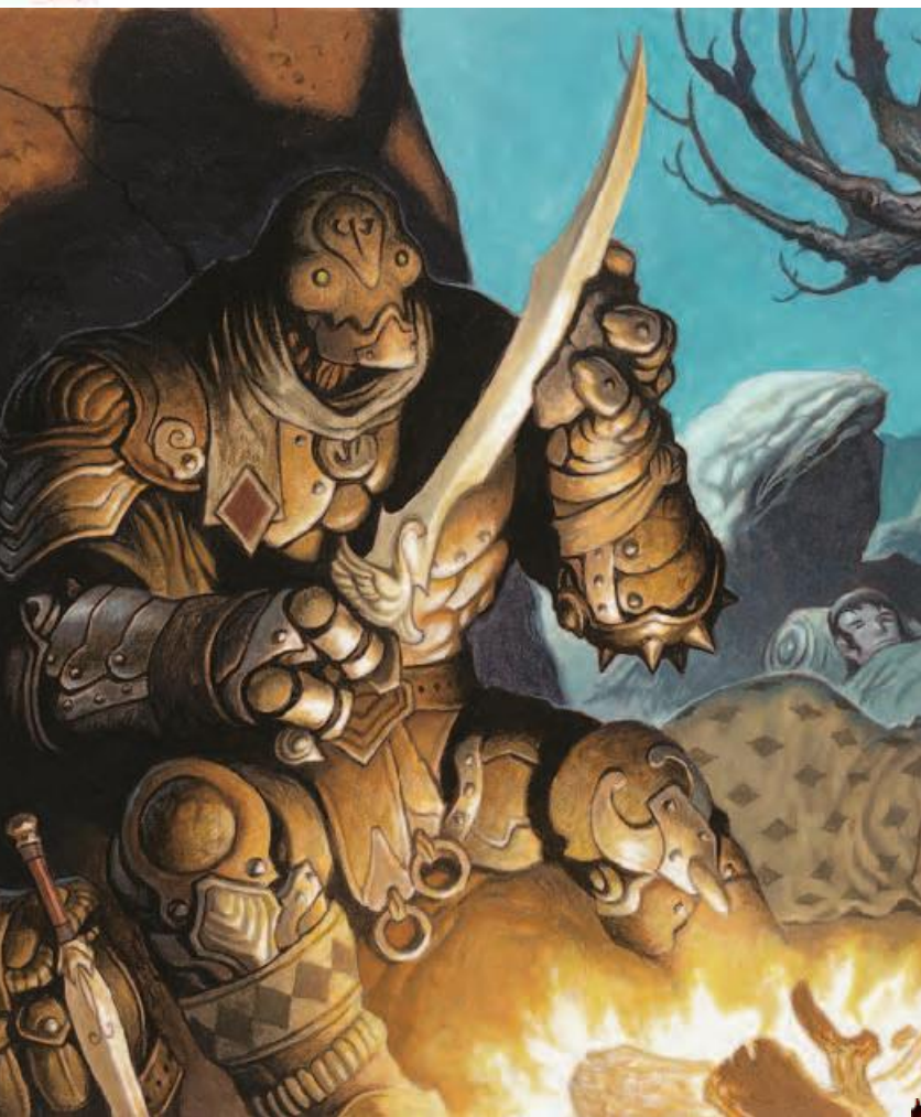
A warforged assassin

Mithral body warforged are often trained in reconnaissance and scouting, but some are selected for more rigorous espionage training. Their gleaming metal plates are alchemically treated to a matte finish, aiding in their stealth.